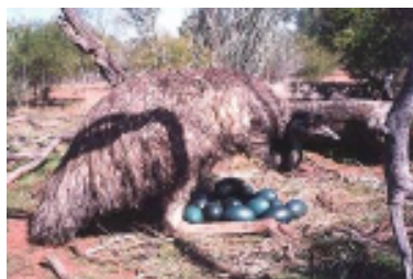
A male incubating eggs.