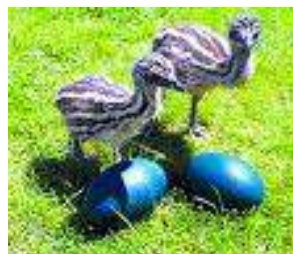
Eggs and chicks.